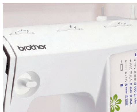
Stitch length and width adjustment

India EPR Compliance | Entity Name: Brother International (India) Private Limited Plastic Waste EPR No.: BO-13-000-08-AADC80263E-22 | Battery Waste EPR No.: 6821475 | Thickness for PE bag: 50 microns or above