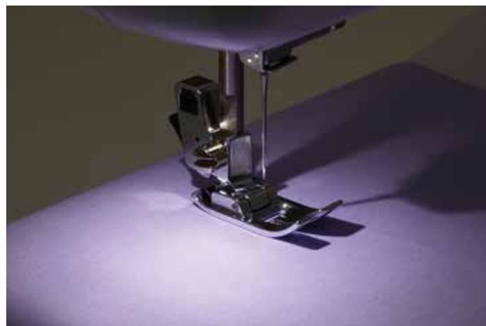
LED lighting for easy viewing