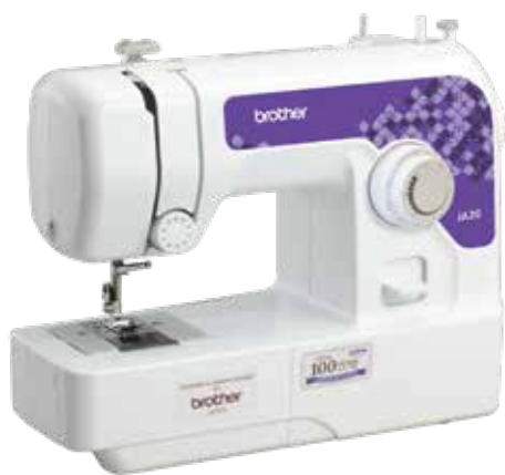
JA20 2 Stitches