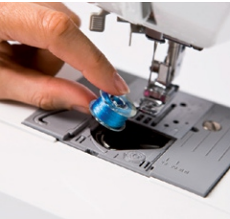
Quick-set bobbin – just drop in a full bobbin and you are ready to sew