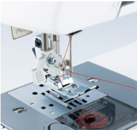
Easy needle threading

India EPR Compliance | Entity Name: Brother International (India) Private Limited Plastic Waste EPR No.: BO-13-000-08-AADC80263E-22 | Battery Waste EPR No.: 6821475 | Thickness for PE bag: 50 microns or above