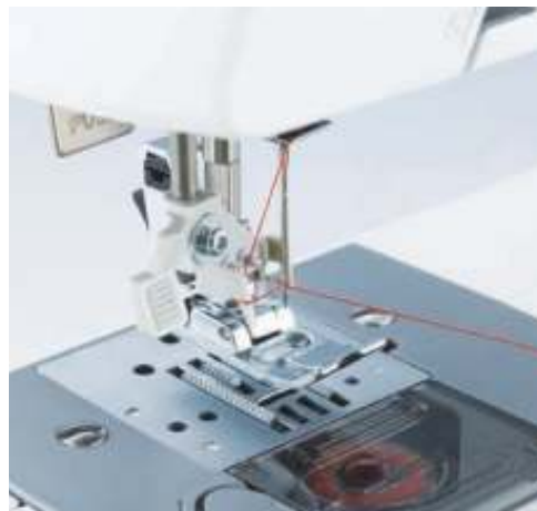
Easy automatic needle threading

Wide range of optional accessories available including quilting feet, etc.