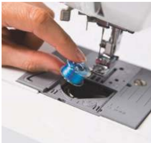
Quick-set bobbin – just drop in a full bobbin and you are ready to sew