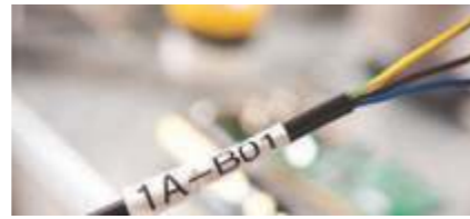
Heat-shrink tube Shrinks and grips cable when heat is applied.