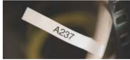
Flexible-ID Tape Use on curved surfaces, sharp bends or cylindrical surfaces.

In addition to the extensive range of TZe tapes in various colours and sizes, specialist tapes for industrial use have been developed for specific labeling tasks including.