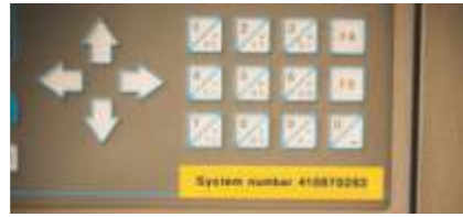
Strong Adhesive Tape Use on uneven, rough and textured surfaces.