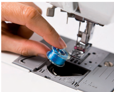
Quick-set bobbin – just drop in a full bobbin and you are ready to sew