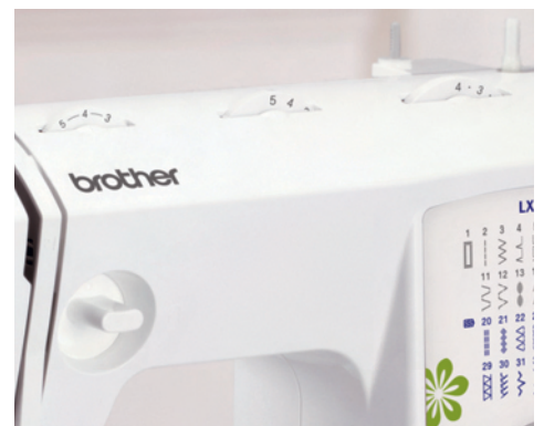
Stitch length and width adjustment

For more information visit : www.brother.in