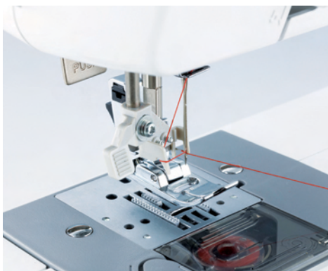
Easy automatic needle threading