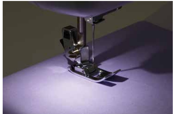
LED lighting for easy viewing