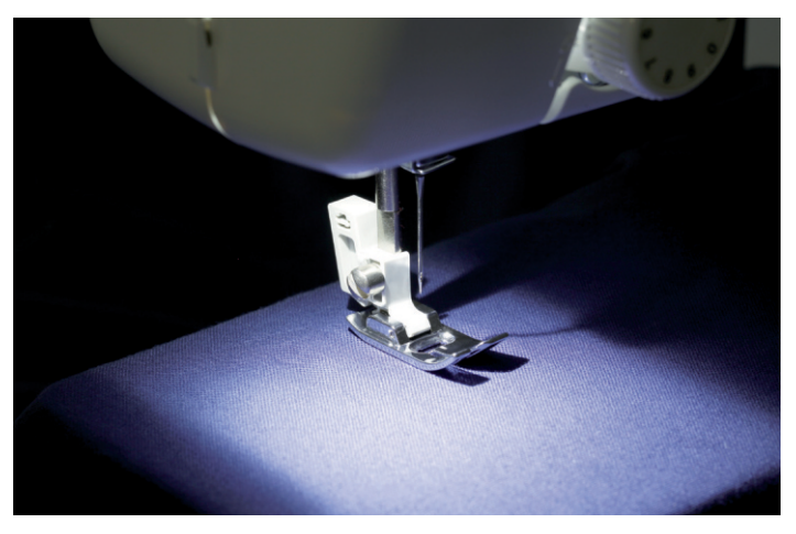
LED lighting for easy viewing